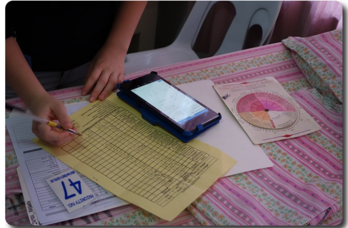
A midwife completing paperwork while using Midwife-EMR on a tablet.